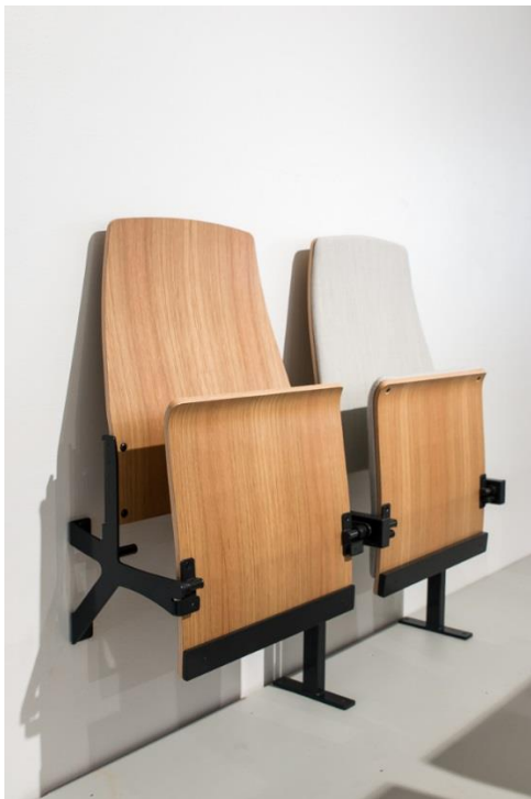
EduWall and Edu